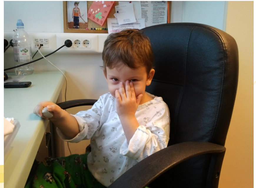
In my office...